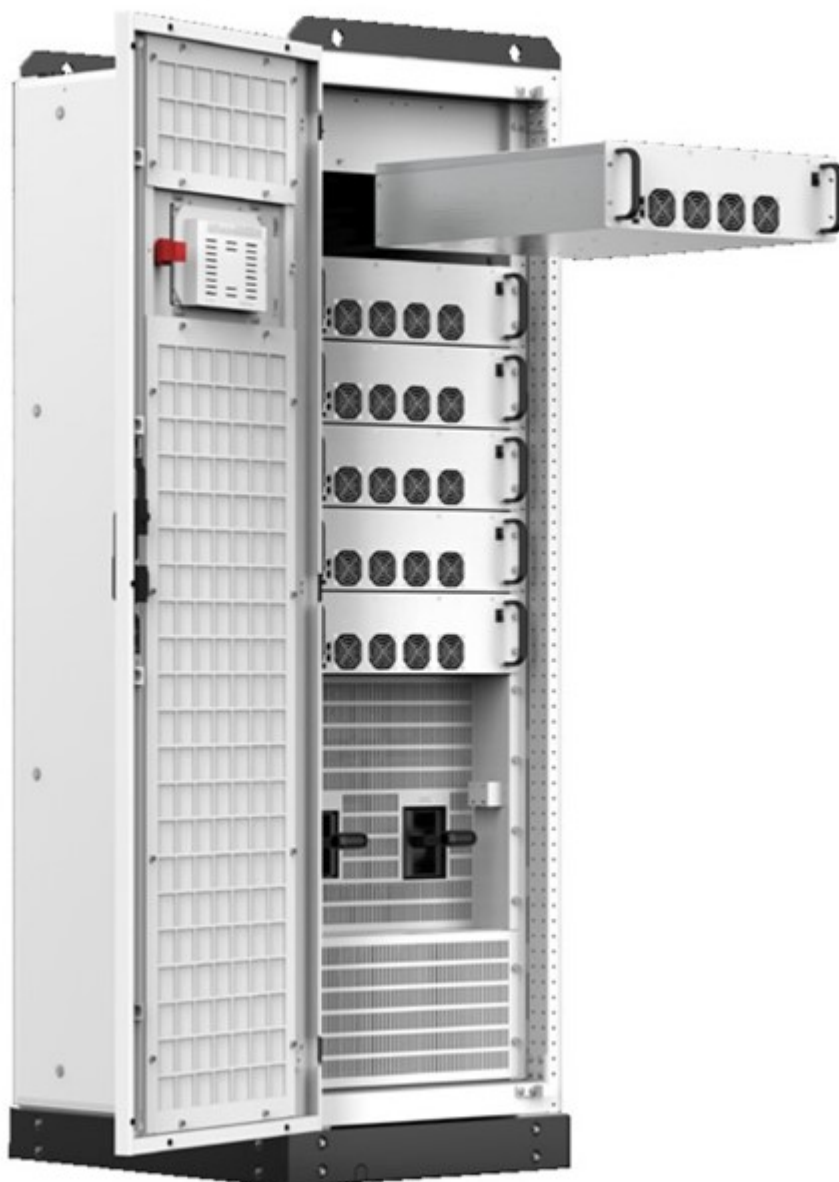
Reference Image for a Battery Storage System

Vancouver, British Columbia--(Newsfile Corp. - June 11, 2024) - Energy Plug Technologies Corp. (CSE: PLUG) (OTCQB: PLGGF) (FSE: 6GQ) ("Energy Plug" or the "Company"), an energy technology company dedicated to innovation and sustainability, is excited to announce the signing of its first battery contract with Ximen Mining Corp. (TSXV: XIM) ("Ximen") to install a 20kWh Battery Energy Storage System ("BESS") at Ximen's Kenville Gold Mine in Nelson, BC.